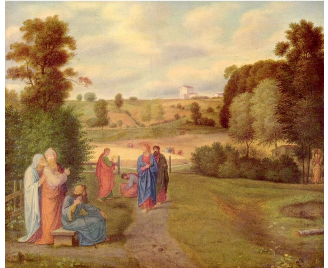
Ferdinand Olivier, Jesus with Disciples, 1840

JANUARY 14, 2018 • 8:15 & 10:30 A.M. SECOND SUNDAY AFTER THE EPIPHANY