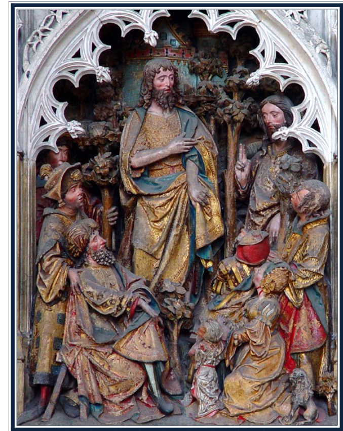
JOHN THE BAPTIST IDENTIFIES JESUS AS THE LAMB OF GOD

WINTER PARK PRESBYTERIAN CHURCH 400 SOUTH LAKEMONT AVENUE WINTER PARK, FLORIDA 32792