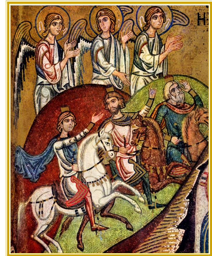
The Magi Journeying to Bethlehem

WINTER PARK PRESBYTERIAN CHURCH 400 SOUTH LAKEMONT AVENUE WINTER PARK, FLORIDA 32792