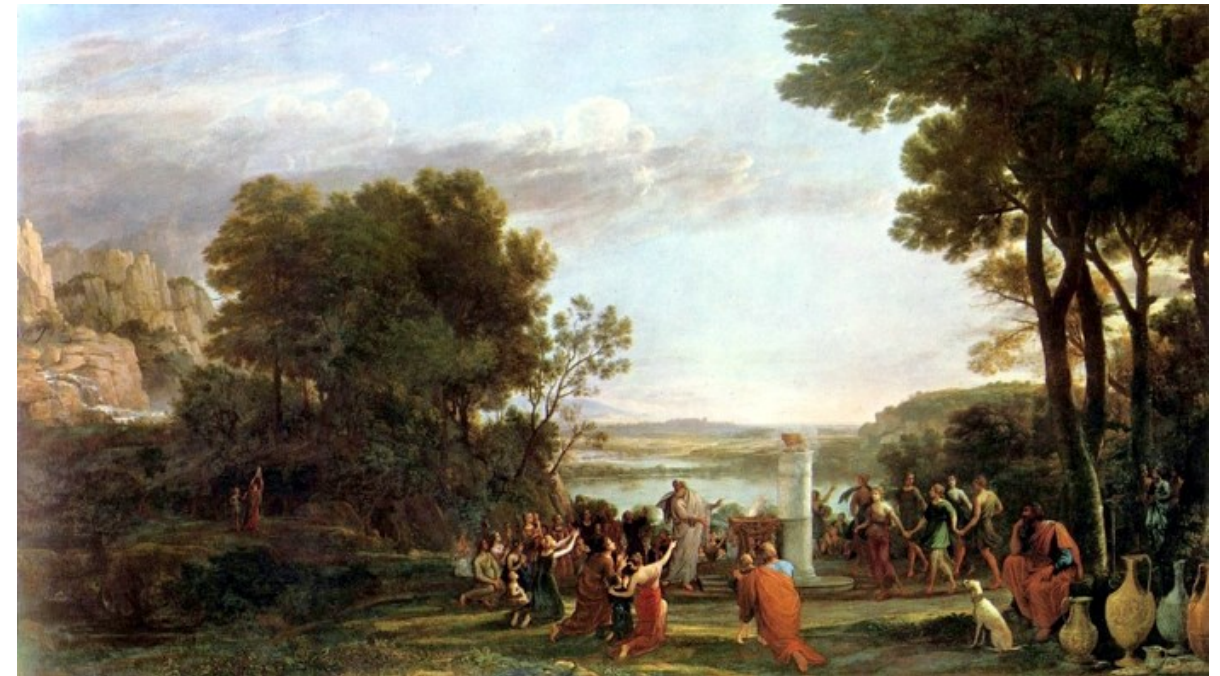
Lorrain Claude, Landscape with Adoration of the Golden Calf, 1653

OCTOBER 15, 2017 • 8:15 & 10:30 A.M. NINETEENTH SUNDAY AFTER PENTECOST COMMITMENT SUNDAY