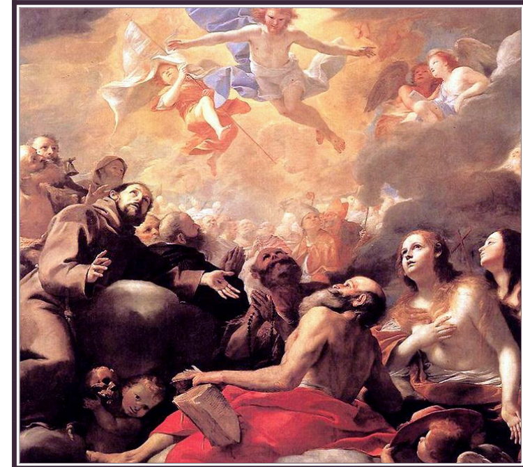
CHRIST IN GLORY

WINTER PARK PRESBYTERIAN CHURCH 400 SOUTH LAKEMONT AVENUE WINTER PARK, FLORIDA 32792