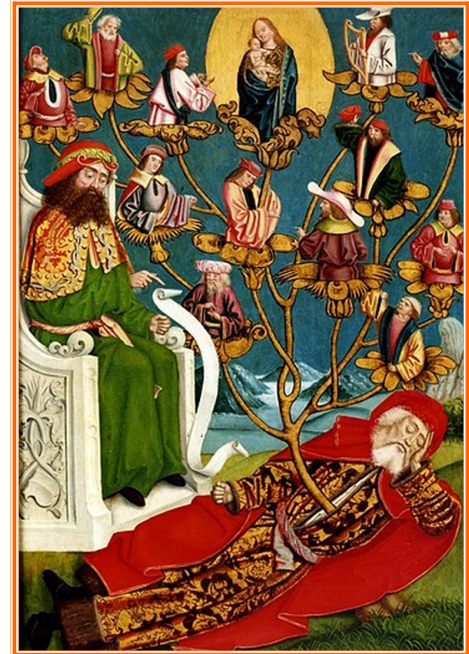
TREE OF JESSE

WINTER PARK PRESBYTERIAN CHURCH 400 SOUTH LAKEMONT AVENUE WINTER PARK, FLORIDA 32792