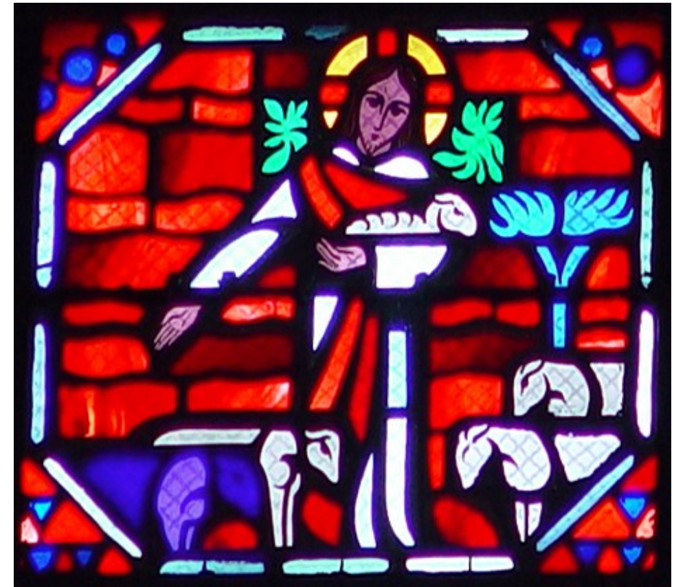
Jesus the Good Shepherd

MAY 7, 2017 • 8:15 & 10:30 A.M. FOURTH SUNDAY OF EASTER HOLY COMMUNION