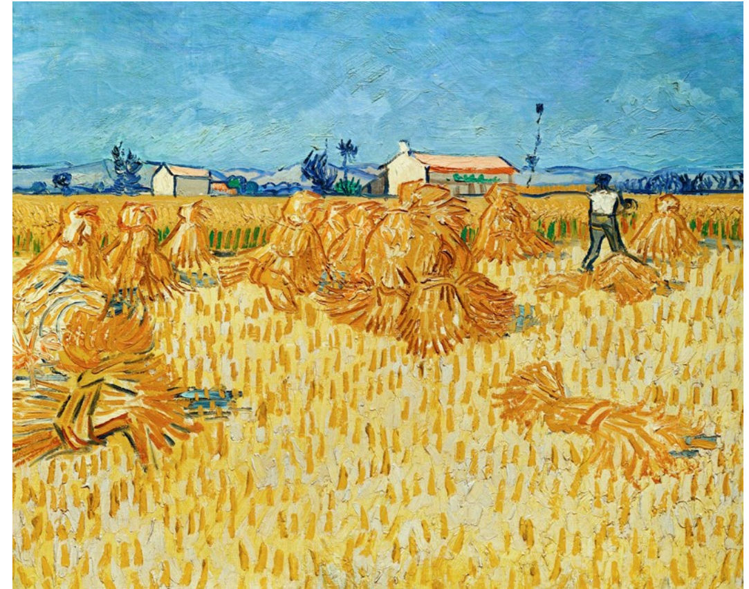
Harvest in Provence

JUNE 18, 2017 • 8:15 & 10:30 A.M. SECOND SUNDAY AFTER PENTECOST FATHER'S DAY