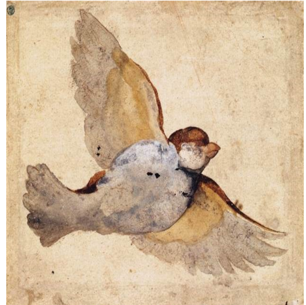
Giovanni da Udine, Studying of a Flying Sparrow , 1515-20

JUNE 25, 2017 • 8:15 & 10:30 A.M. THIRD SUNDAY AFTER PENTECOST