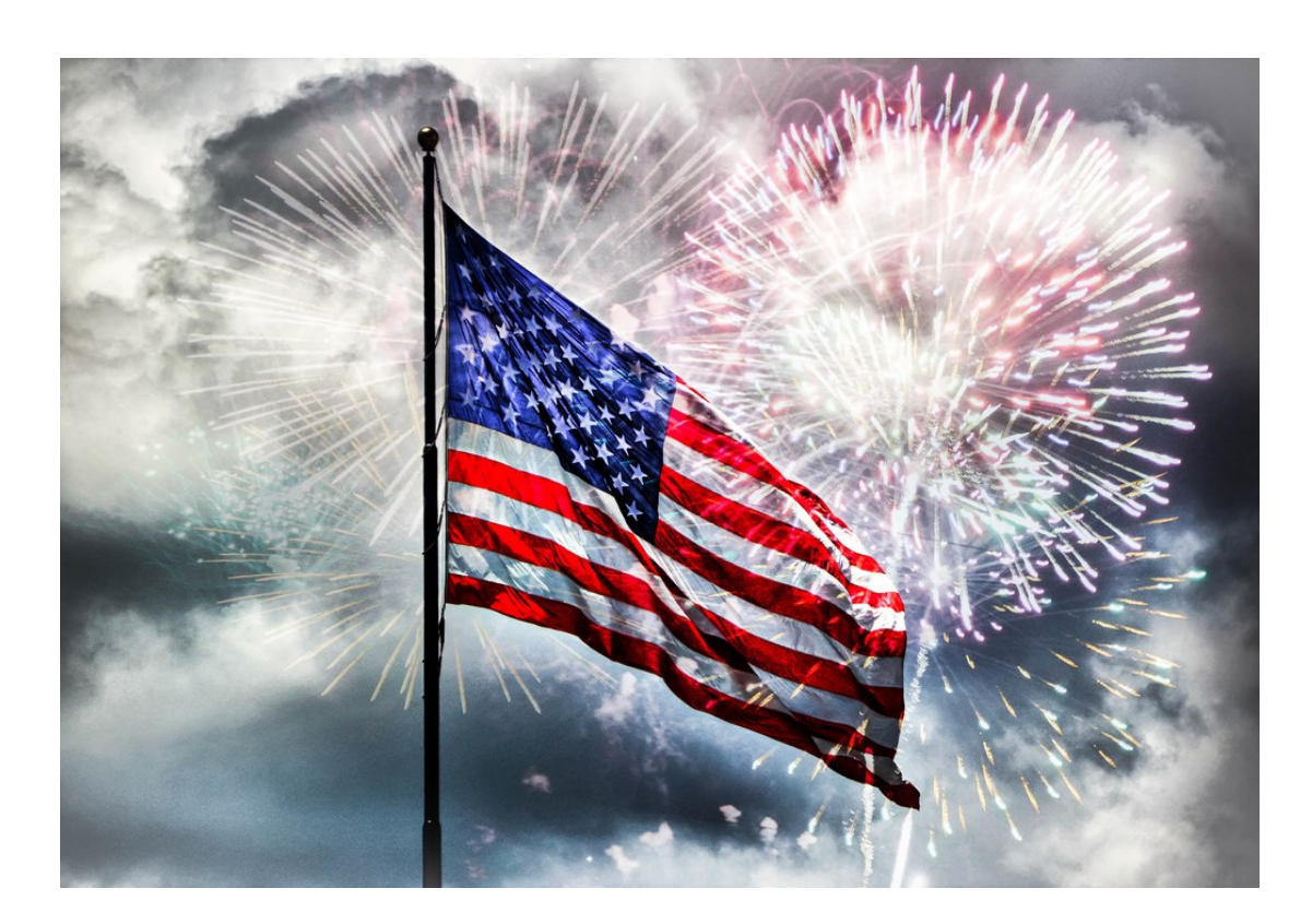
Happy 4th of July!

JUNE 30, 2019 • 8:15 & 10:30 A.M. THIRD SUNDAY AFTER PENTECOST