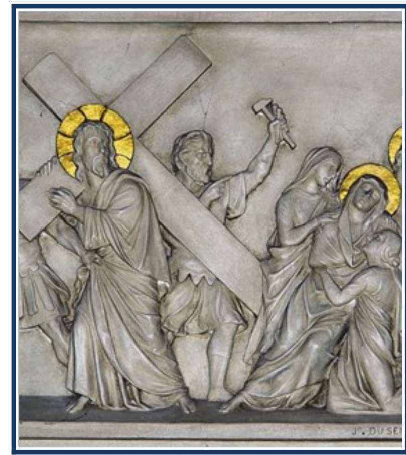
Stations of the Cross IV

WINTER PARK PRESBYTERIAN CHURCH 400 SOUTH LAKEMONT AVENUE WINTER PARK, FLORIDA 32792