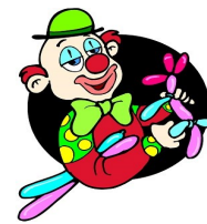
PJ The Clown