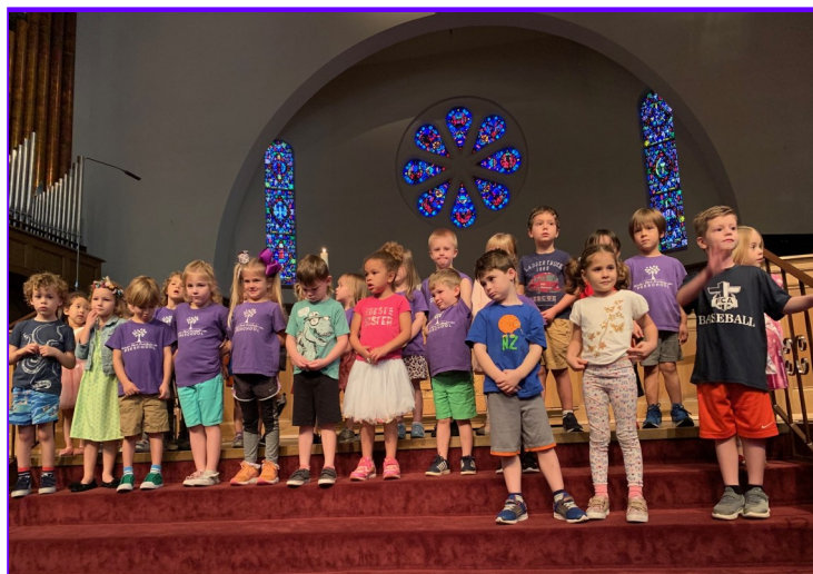
We invite children celebrating birthdays each month to stand on the steps to the altar during Family Chapel and we sing Happy Birthday to the group.