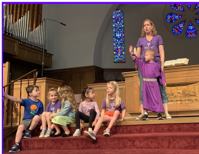
During their Wednesday morning Chapel program VPK students acted out the story of Jesus' disciples, how they followed him and learned from him.

Children from our VPK classes are selected to participate as Chapel Helpers and help to act out the week's story of God's love for us. We welcome preschool families to join us for Family Chapel on the third Wednesday of each month. During Family Chapel we invite children celebrating birthdays that month to stand on the steps to the altar while we sing Happy Birthday to the group.