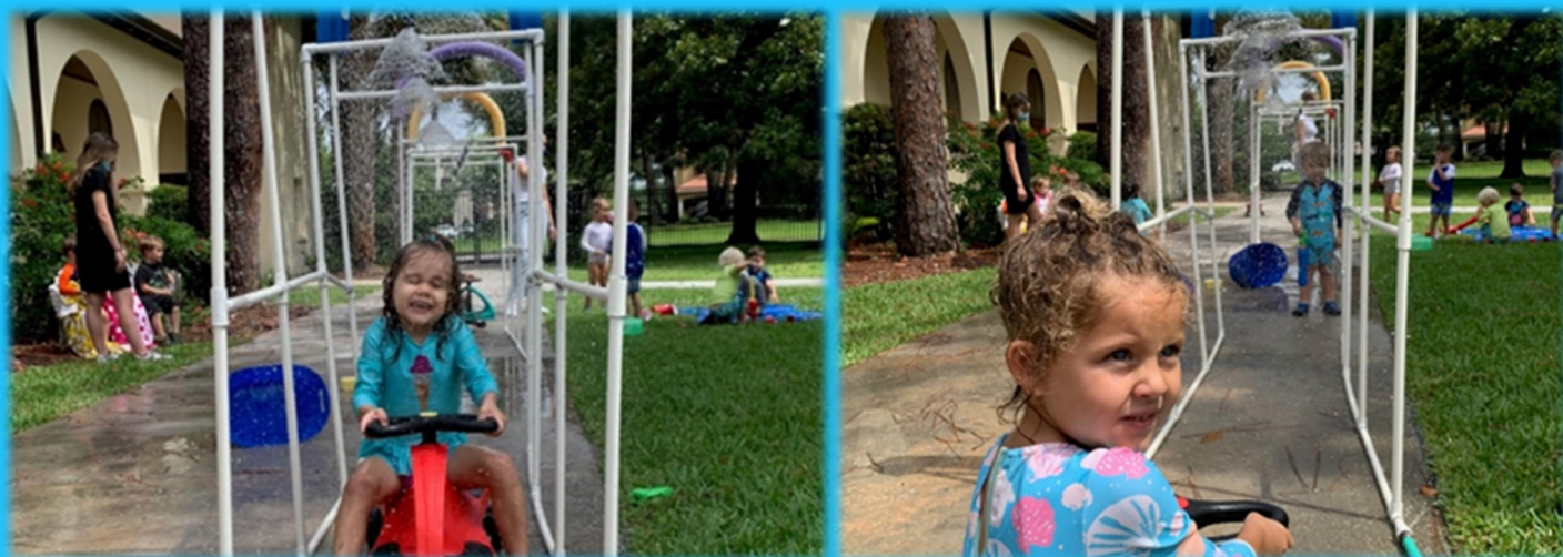
Cruising through the Kid Wash at WPPP summer camp.

Summer will be over before you know it, and we will host our annual Meet Your Teacher event on Monday, August 9. The first day of the brand new school year is Tuesday, August 10.