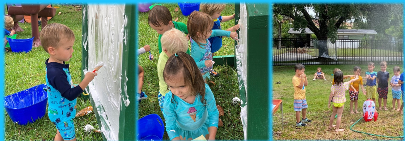
Painting a shaving cream masterpiece at a recent summer camp splash day.