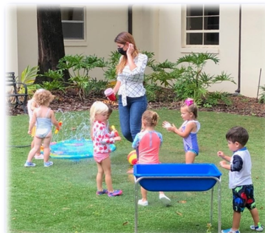
Campers of all ages love splash days at WPPP summer camp.

July is another busy month of camp as the children will enjoy nature activities, learn about the different animals on our planet, and blast off to outer space.