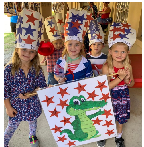
The Alligators VPK class made chef hats and carried cutting boards, pans, bowls and wooden spoons to make music in their Culinary Chorus!