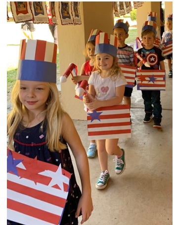
Koalas VPK class made hats, flags and rocket ships to carry during the Patriot's Day parade.

Wrist bands will be available at the door for $25.00 per family. Adults do not need wristbands.