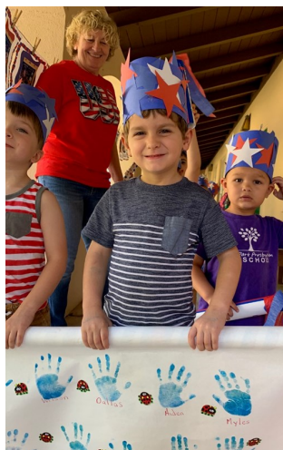
The Ladybugs three year old class made a banner with their names and handprints, hats and streamers to wave during the Patriot's Day parade.