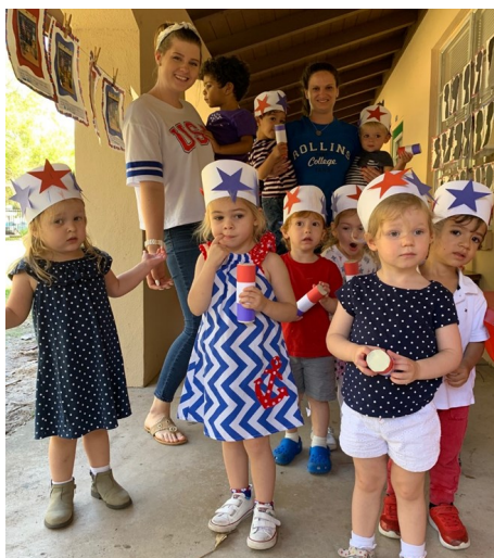
The Foxes two year old class made shakers and hats for their performance in the Patriot's Day Parade.