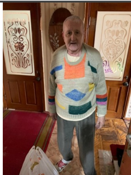
SOME OF OUR SWEET PENSIONERS.

Our families are growing. Two older girls joined the girls' home family in Odesa in the fall. I had the opportunity to meet them when I was there in November. Now, this same family has grown by three more as they welcomed three little sisters who have recently become orphaned. We are extremely grateful that our two new homes will be completed soon. The final touches are being added and then we will need to furnish them. We are hoping to be move-in ready by the end of May. No small feat, understanding that construction has been done during and around a war.