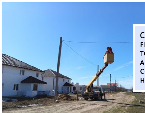
CONNECTING ELECTRICITY TO OUR ALMOST COMPLETED HOMES